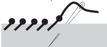
Beaded Whip Stitch